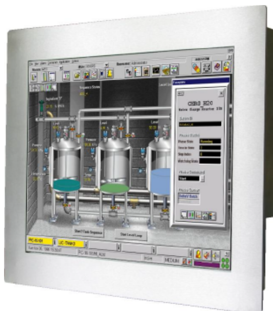
Stainless Steel Front Bezel