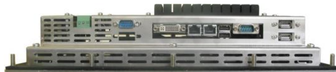
Bottom View Panel - PC