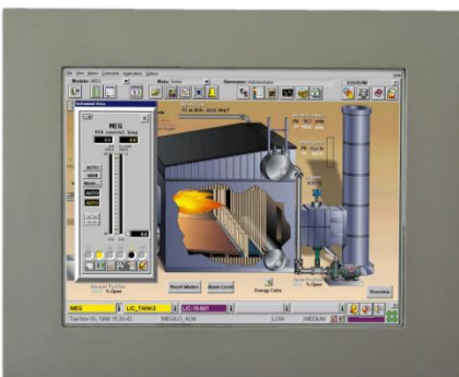
Panel-PC with 10.4" TFT Display and Stainless Steel front Bezel

The PC is available with 6 different Display Sizes. Depending on the mounted Display, the