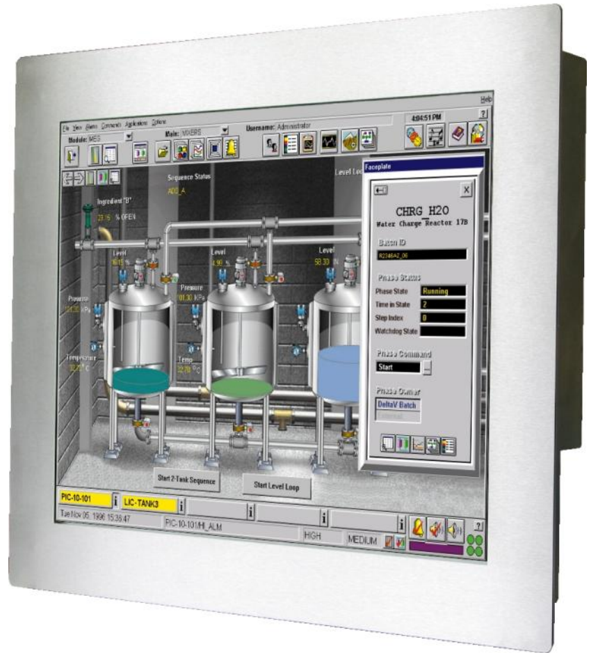
Panel-PC with 19" TFT Display and Stainless Steel Front Bezel

UTICOR offers with the 6th Generation Intel Core i mobile Processors, a line of Panel PCs, which have a completely fanless Design.